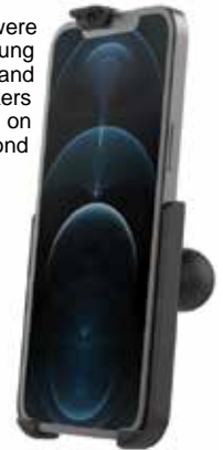
RAM® Form-Fit Cradle for Apple iPhone 12 & 13 Pro Max with Ball P/N 11-19216

These high-strength composite, form-fit cradles were designed specifically for the Apple and Samsung devices. Allowing for one-handed docking and removal, all buttons, cameras, ports, and speakers are left exposed. With the two-hole AMPS pattern on the back of each cradle, attach to a RAM® diamond ball base and additional RAM® components.