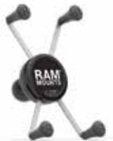
RAM® X-Grip® Large Phone Holder with Ball P/N 11-12987