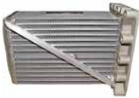
8000545 10" Non-Congeaing Universal 7th Stud

Aero-Classic's engine mounted oil coolers for Continental powered aircraft offer high quality features such as a CNC machined base for reliable, leak-proof mounting. Aero's line of Continental front mounted oil coolers feature a hassle free design that accommodates both 7th stud and non-7th stud engine cases - eliminating the chance of getting the "wrong" oil cooler. The oil coolers on Continental engines often mount directly to the engine and do not require hoses. All FAA-PMA approved with supporting FAA 8130-3 documentation, and full two year warranty.