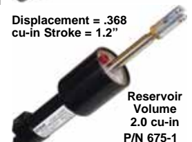
Reservoir Volume 2.0 cu-in P/N 675-1