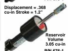
Reservoir Volume 3.05 cu-in P/N 676-1