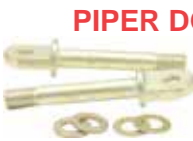
PIPER DOOR HINGE EYEBOLT SET The eyebolts are probably the most neglected parts on the plane. They hardly ever get lubricated and due to their exposure to the elements, rust in the pivot point can prevent the door from closing properly and should be replaced from time to time as they wear. The set contains two of the proper eyebolts and detailed installation instructions. The hardware is FAA approved for Piper PA28, PA32, and PA34 aircraft. Rear Door .....P/N 05-03636 Front Door .....P/N 05-03635