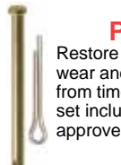
PIPER DOOR LATCH CLEVIS PIN Restore solid latching of the doors to the fuselage Due to normal wear and lack of lube, the door latch clevis pin should be replaced from time to time to maintain the proper operation of the door. The set includes 1 clevis pin and 1 cotter key. All the hardware is FAA approved for Piper PA28, PA32, and PA34 aircraft. P/N 05-04644