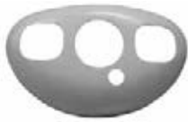
PA 12 & 14