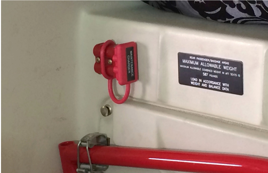
Finished installation with dust cover labeled, ready to connect BatteryMINDER.