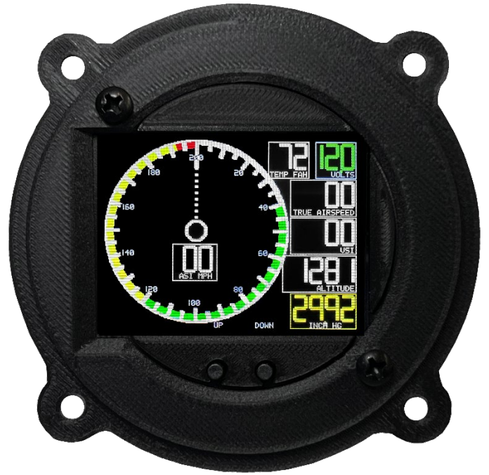
Airspeed Indicator in 3 1/8 cutout packaging showing digital / analog dial representation; OAT, system voltage; True airspeed; VSI; altitude; settable Kollsman window.