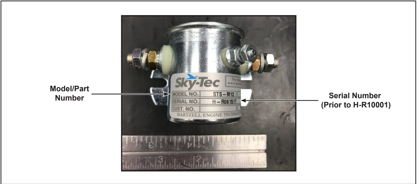
Affected Master Contactor. Model Number STS-M12 Shown. Figure-1